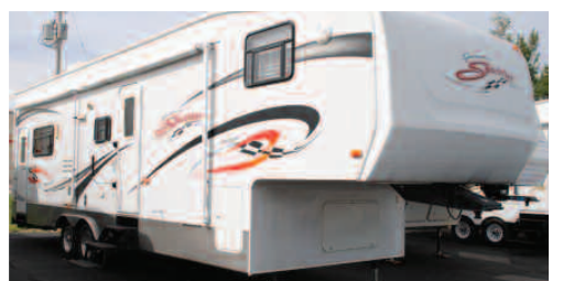
USED 2007 KZ SPORTSMEN SPORTSTER 33P FIFTH WHEEL Toyhauler, slideout, exterior shower, awning. Regular $11,995. SALE PRICE $9,995