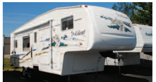
USED 2006 WILDCAT 28RK 5TH WHEEL Slideout. Regular $12,995. SALE PRICE $9,995