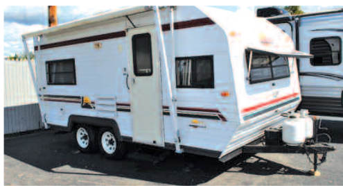
USED 1995 SUNLINER T 1850 TRAVEL TRAILER Regular $6,995. SALE PRICE $3,995