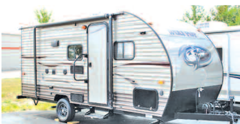
2017 CHEROKEE WOLF PUP 16BHS TRAVEL TRAILER Sleeps 5. Low price and easy to pull. MSRP $19,495. SALE PRICE $10,495