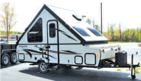
NEW 2017 ROCKWOOD HARD SIDE SERIES A122S POP-UP CAMPER MSRP $15,495. SALE PRICE $12,495