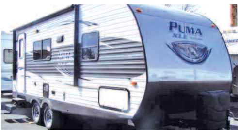
NEW 2017 PALOMINO PUMA XLE 21FBC TRAVEL TRAILER Slideout, front bedroom. MSRP $23,294. SALE PRICE $15,995

We are clearing out all of our used RV's. Save Thousands of dollars on every Used RV in stock.