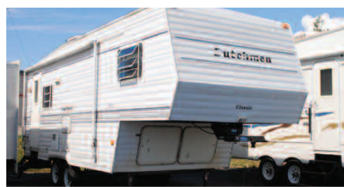
USED 1998 DUTCHMEN 240 5TH WHEEL Slideout. Regular $3,995. SALE PRICE $4,995