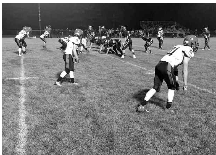
East Jordan lines up for an offensive play as the Bulldogs prepare to stop them.

The Red Devils (4-1 overall, 2-1 NMFL - Legacy) will host long time rival Charlevoix, (4-1, 2-1 NMFL - Leaders) on September 30 at Boswell Stadium, game time is 7pm.