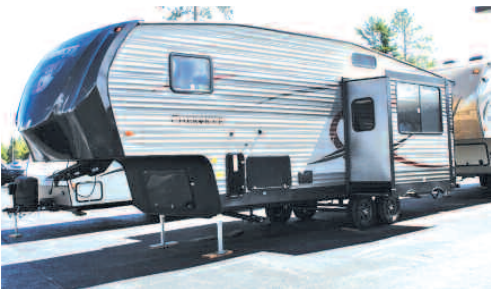
NEW 2016 FOREST RIVER RV CHEROKEE 255P 5TH WHEEL Limited pkg, pwr. awning, back-up camera. MSRP $34,311. SALE PRICE $22,995