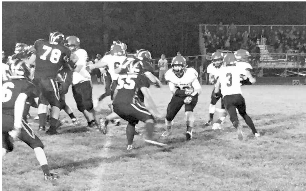
Inland Lakes gives chase as the Red Devils send players in motion all over the field.