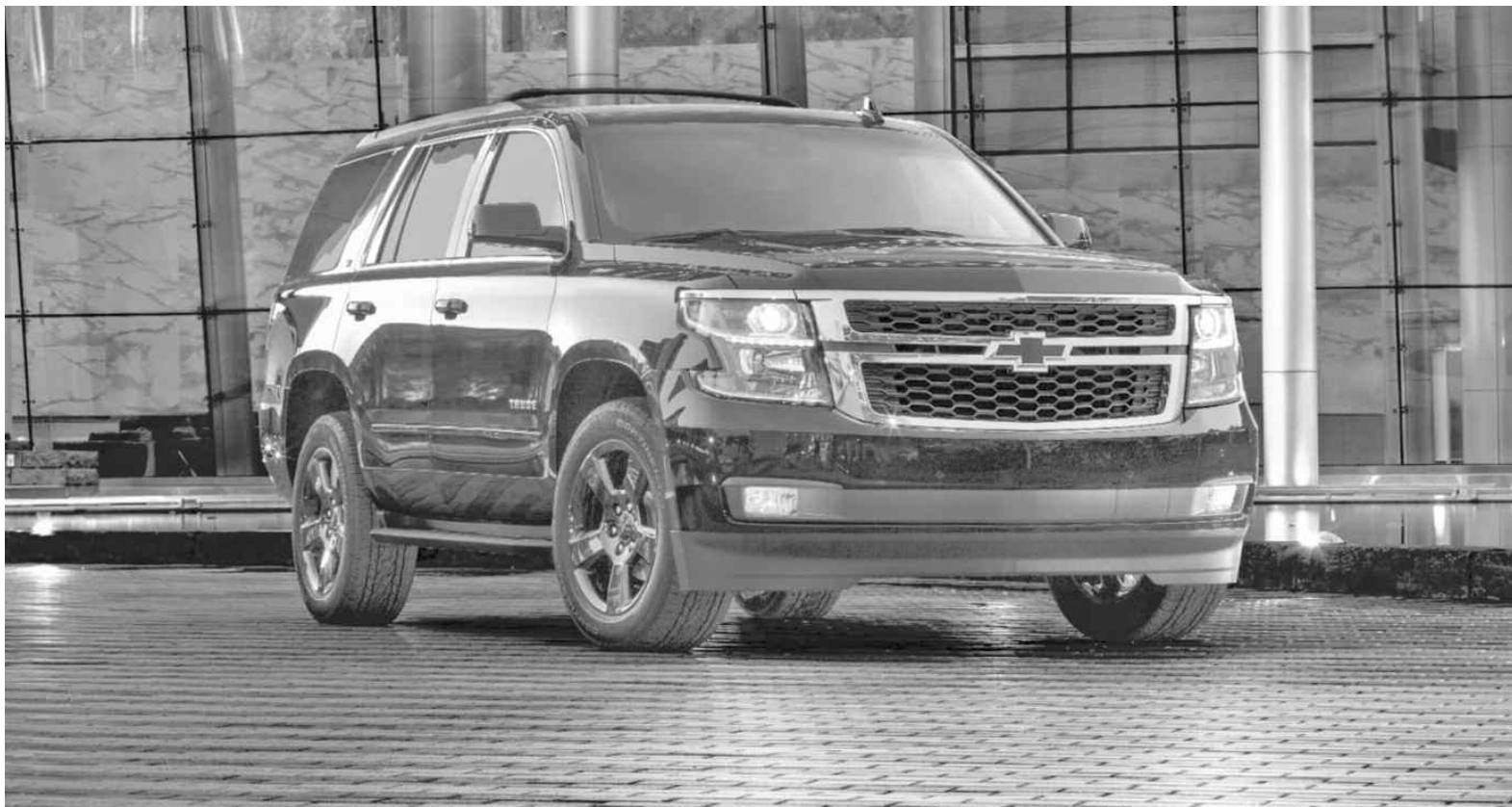
New for 2017, the Tahoe and Suburban LT models are offered with a Midnight Edition package. The LT Midnight includes all of the features found on both the LT trim levels of Suburban and Tahoe and adds 20" black wheels, all-season tires, roof rack cross rails, black assist steps and black Chevrolet "bow tie" logos.

Chevrolet announced that it is expanding its popular specialty models to include Midnight Editions of its segment-defining Tahoe and Suburban full-size SUVs. With years of heritage to build on, Chevrolet continues to forge ahead in sales and share with these two storied full-size SUV entries. Tahoe retail sales are currently up 18 percent compared to 2015, while Suburban sales are up 30 percent compared to 2015. Market share for Suburban and Tahoe has risen a combined 3.6 percent this year, and Chevrolet continues to lead the segment.