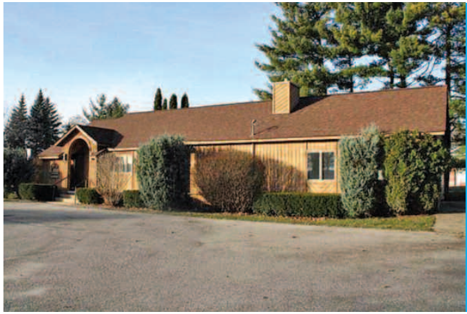
306 MAIN STREET, EAST JORDAN

Not only is this professional building in turn key condition, it also has its own parking lot. This building has been used as a dental facility recently and has 5 sectioned rooms with 3 being plumbed with water. There is a reception area, and a waiting room which are up to date and have a lot of natural light. There is a dark-room on site as well as, a work room and a break room and a partial basement for storage. Price is just for building, however dental equipment is negotiable. MLS 449425. $119,900 Ask for Mike Stark or Holly Nierman