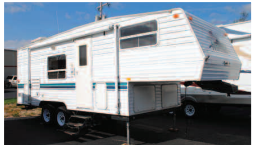
USED 2002 NOMAD SCOUT 237 5th Wheel. 1/2 ton towable SALE PRICE $6,995

Most Dump Trailers come with Tarp Kit, Adjustable Coupler and 7 K Jack.