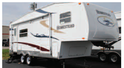
USED 2006 STARCRAFT HOMESTEAD LITE 240 RGS TRAVEL TRAILER 1/2 ton towable, slideout, rear kitchen. Regular $11,995 SALE PRICE $9,995