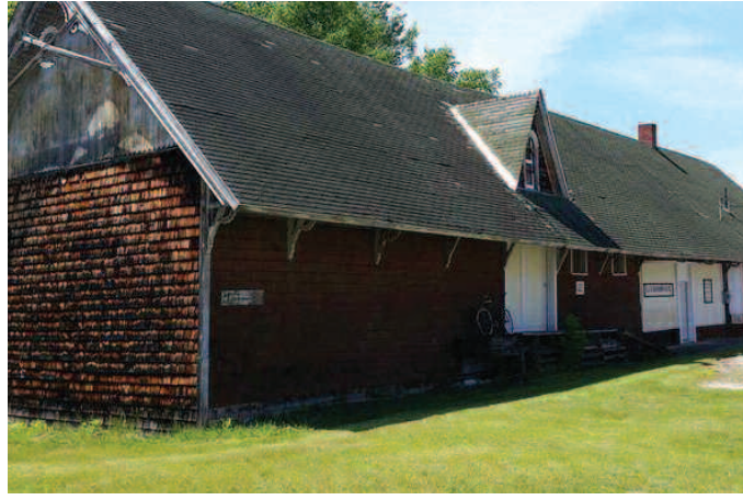
204 DEPOT, EAST JORDAN