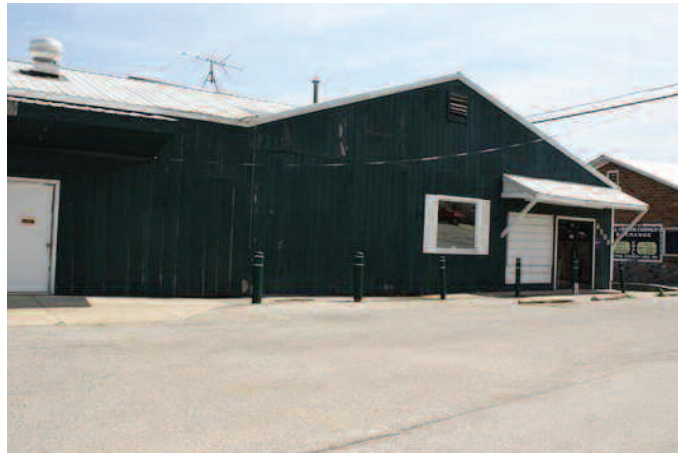
6508 CENTER STREET • ELLSWORTH