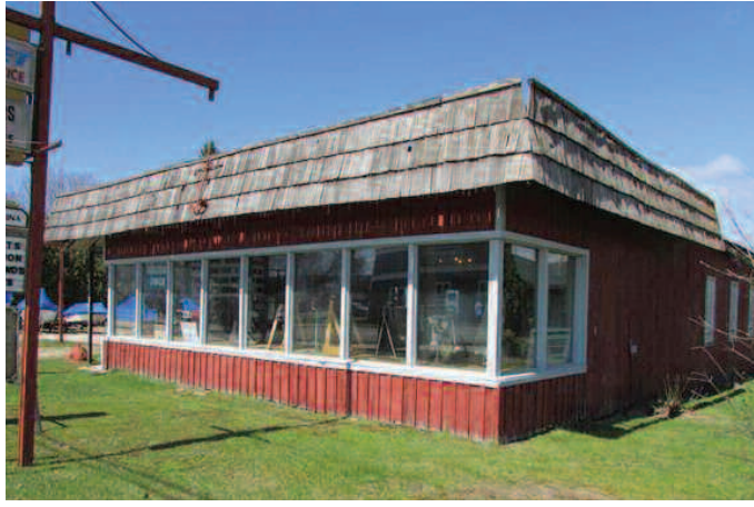
204 WATER STREET • EAST JORDAN

This is a great business opportunity, the long established waterfront marina located on the South Arm of Lake Charlevoix in the City of East Jordan. Great exposure for retail, boat and water accessories. Property consist of an unheated storage building 50 x 104 with attached sales and show room that is 36 X 98. Good opportunity for a multi-use business. Located in the waterfront district area. MLS #447866. $498,500. Ask for Mike Stark or Holly Nierman