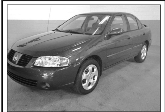
2005 Nissan Sentra 1.8

Used 2005 Puma 189 FL Travel Trailer. Great value on a nice used RV. Regular $8,995. Sale Price $6,995. Petoskey RV USA. 2215 North US 31, Petoskey. 231-347-3200.